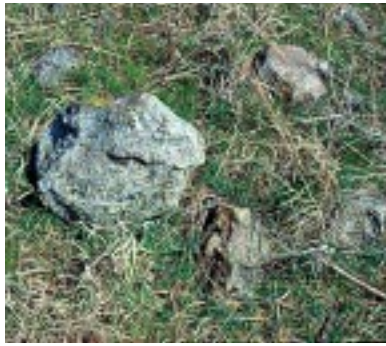
Lamproites, Woodson County.

Lamproites .—Almost all rocks at the surface in Kansas are sedimentary in origin, but this region is also known for exposures of igneous rocks in Woodson and Wilson counties. These rocks, which geologists called lamproites,